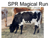
SPR Magical Run