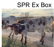
SPR Ex Box